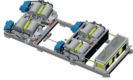
Layout x-road curve

Finally, the scope of the x-road curve is completed through integration of a simulation environment for integrated vehicle test via typical driving situations.