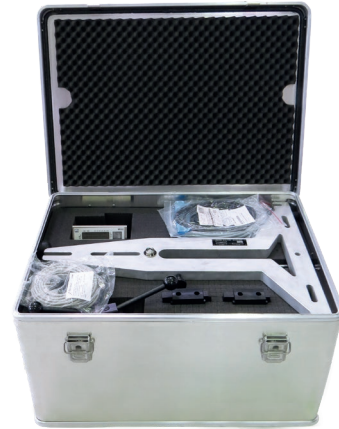
Test set in aluminium roll box